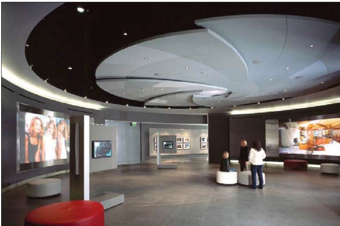
© Julius Shulman and Juergen Nogai

The Annenberg Space for Photography is an innovative cultural destination dedicated to both digital images and print photography by established and emerging artists.