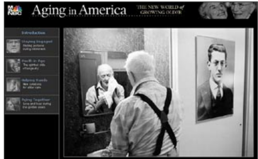
"Aging in America" MSNBC.com, First Place, Multimedia Division / Multimedia Story or Essay http://www.msnbc.msn.com/id/3677346/